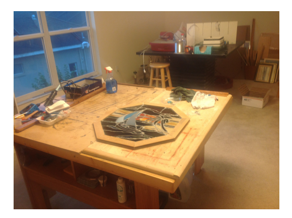
Gary's stained glass studio at his home.

I do not like to use "kits" or designs that others have created. I discovered a computer program that enables me to "draw" stained glass outlines either free-hand or by tracing a scanned picture or photo. With this, even though I cannot "draw," I have been able to combine scanned pictures and create original patterns that I can then use to build a stained glass window or lamp.