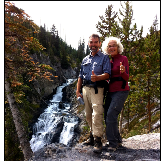
Mystic Falls, Yosemite National Park September 19, 2014

Retirement is a miracle. We are so grateful to have this time when we don’t have to go to a job, when we have health and resources. We want to live simply and to grow. This is a time to try new things, or to have time for things which we had no time during our active professional lives. We want to take classes, dance, paint, pick up litter, greet our neighbors, laugh and walk more, become more gentle, show appreciation, reassure others they can make it, model letting go of professional work, become more one with spirit, and grow into elders. The journey continues.