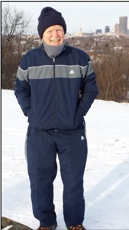
14 below 0 wind chill

We had a fine walk, though I certainly felt it after finally getting my shower and noting that I was a little more tired than usual. It was worth it; there I was with my wife, two sons, three grandchildren and their very energetic dog, enjoying one of those rare cold, but extraordinarily sunny, Rochester days.